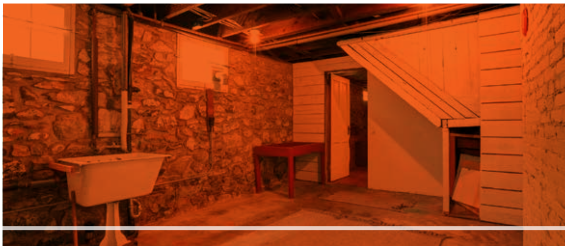
Illegal Basement & Cellar Occupancy

Complaints regarding illegal cellars or basements should be directed to 311 , which will forward the complaint to the New York City Department of Buildings (DOB). For more information, please refer to DOB's website at nyc.gov/buildings .